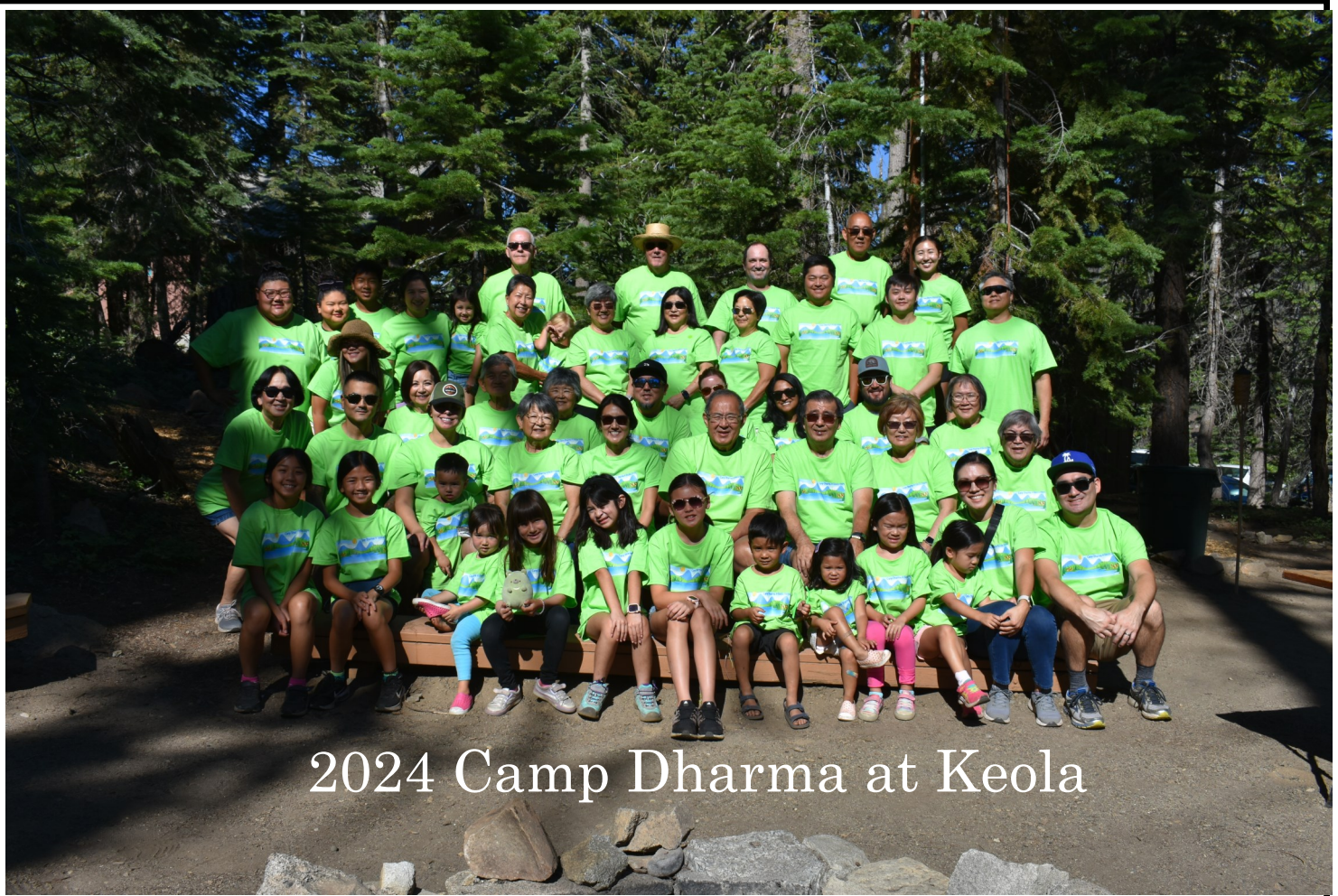
2024 Camp Dharma at Keola