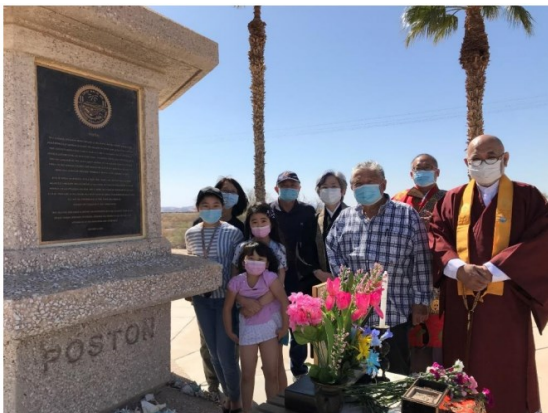
Group photo taken on March 21, 2021

Email: rev.kaznakata@gmail.com or call/text: (424) 666-7101