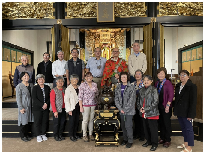
The 2024 Reedley Buddhist Church Cabinet and Reedley Buddhist Women's Association Cabinet were installed at the January 14, 2024 service.