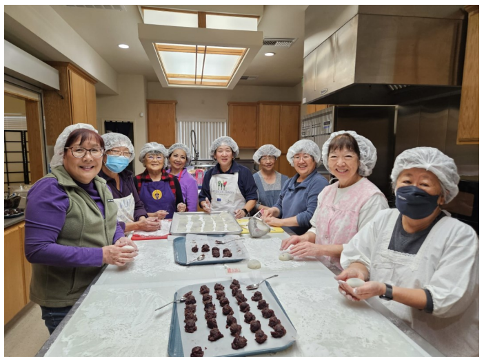
BWA mochi manju makers were busy at work making the delicious manju for Hoonko.