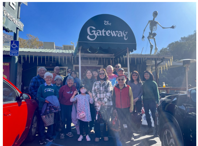
Visalia BWA Trip to Three Rivers